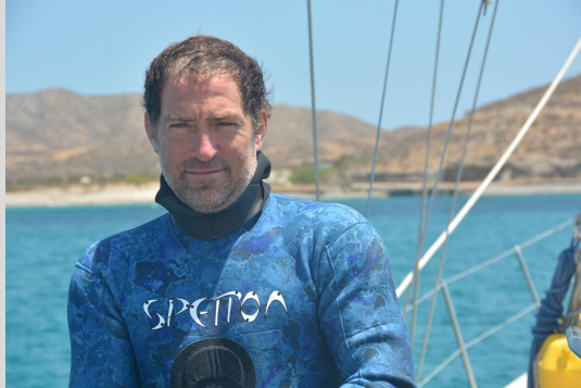
Supervising Editor - Greg O'Toole