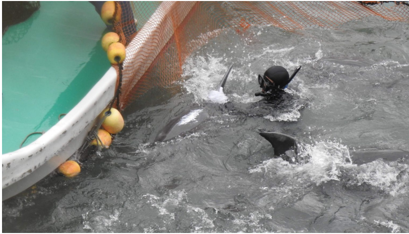
You can shoot like this with a telephoto lens