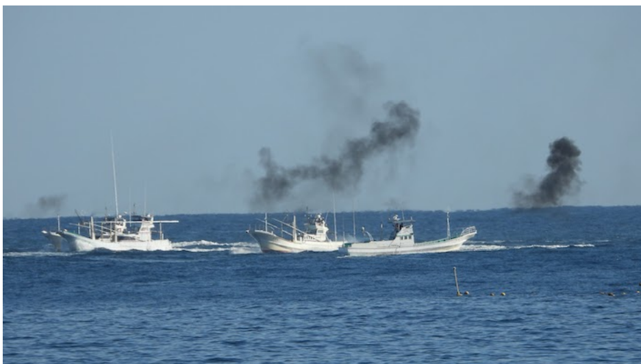
View of dolphin hunting boats from Hatajiri Bay

Dolphins that are to be sold to the aquarium may be left overnight in Hatajiri Bay. When I go to check the situation at night, I can hear the breathing sounds of the dolphins. Security guards hired by Taiji Town are on alert all night long.