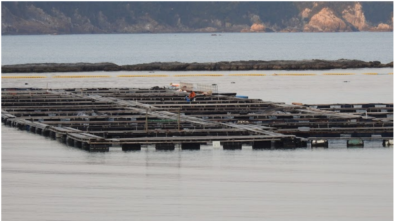
Sea pen cages holding dolphins captured by Taiji dolphin hunting.