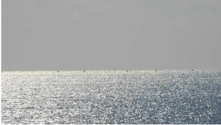
The hunting formation formed offshore looks like dots.

About 10 ships lined up in a row offshore, and if they were heading to the left (north), it would be judged that they had begun to drive dolphins. This line-up is also called a formation .