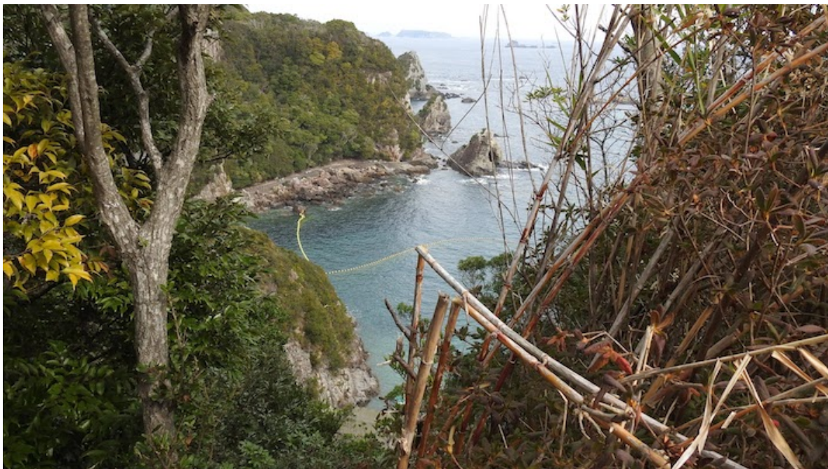
Looking down on 'Kageura' killing cove from the left side of Takababe hill

In some places, you can clearly see dolphins trying to protect their children. Also divers (dolphin hunters) entering the sea and catching dolphins, and dolphin trainers carrying dolphins. The area where dolphins are captured and killed is covered with a gray sheet so that they cannot be seen. From where you can't see, you can hear the sounds of dolphins breathing, the sound of splashing water, the voices of dolphin hunters, and the voices of dolphin trainers sorting dolphins.