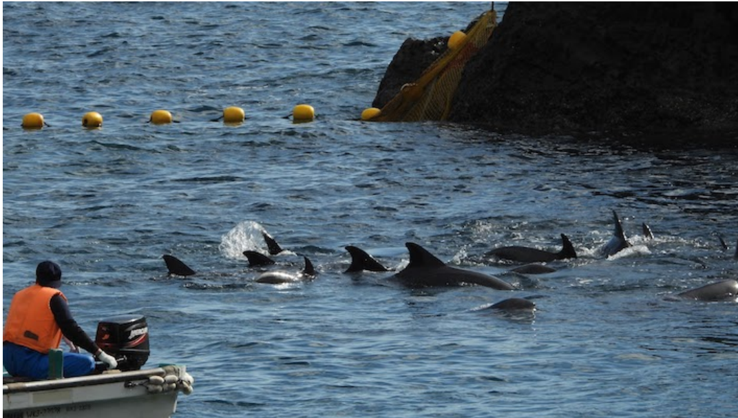
Kageura 'killing cove' is on the right. Dolphins disappear as they are driven in.

If the dolphins that have been driven are Pacific white-sided dolphin, they will be caught outside the embankment of the Taiji fishing port.