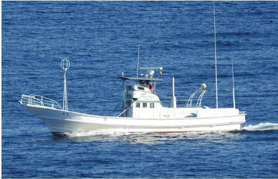
Dolphin hunting boat and banger poles, under sail

When the dolphin hunting boat go offshore, move to the top of the cape. One of the following three places is good on the cape.